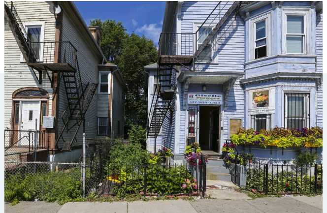
Giselle Flowers, a business on land owned by DNI. DNI is building another commercial property space to provide affordable rent for local small businesses.

As momentum around CLTs build, there are key challenges that can be addressed by City policy and resources. These include: