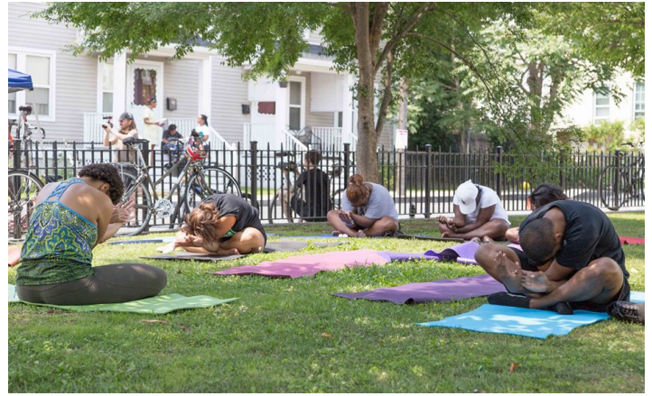
Residents celebrating the 25th anniversary of DNI on Dennis Park on DNI with a day of activities organized by residents.