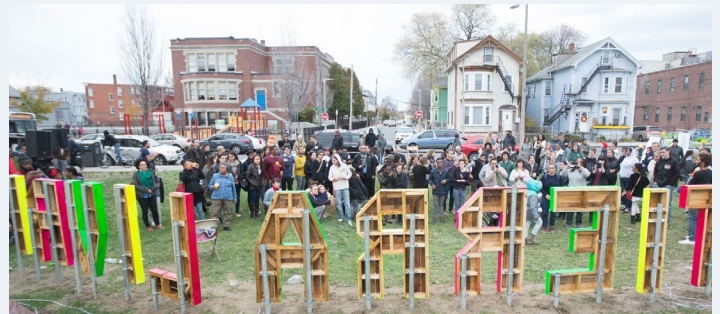
DSNI and DNI using public art to engage residents in planning on one of the last vacant parcels transferred to the DNI land trust in the Dudley Triangle.

DSNI's CLT, Dudley Neighbors, Inc. (DNI) , was created to address racial disparities around access to land, homeownership and wealth creation and now hosts 226 units of affordable housing on its land. DNI helps families build wealth by taking land in the neighborhood out of the speculative market and selling homes to income-qualified homeowners at affordable prices.