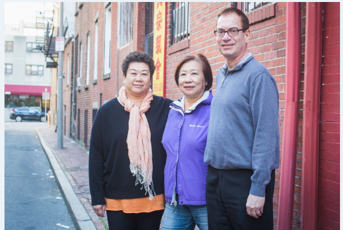
Members of the Chinatown Community Land Trust board.