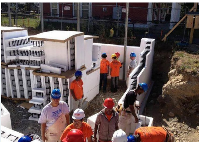
Students learning carpentry skills at Madison Park Technical Vocational High School and building a home on DNI. The project is in partnership with YouthBuild and Boston Carpenters Training Apprentice.

These recommendations have been successfully implemented in cities across the country. The following page details examples of a range of successful City-CLT partnerships.