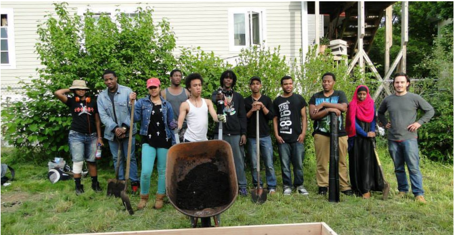
Youth residents of Roxbury develop empty lots in community gardens through the Roxbury Environmental Empowerment Project of Alternatives for Community and Environment. They are in the process of planning to transfer these gardens to a community land trust to preserve them permanently and provide access to healthy, fresh, food.