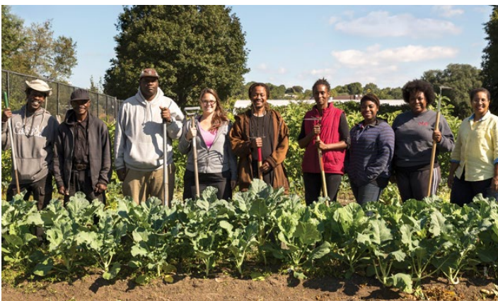
Seven farmers who graduated from Urban Farming Institute's training program last year.

Momentum for CLTs is building in Boston. Government agencies and community-based organizations alike are harnessing the growing interest in, and demand for, this particular affordable housing strategy.